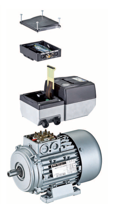
8400 motec 5.0 to 10.0 Hp (4.0 to 7.5 kW)